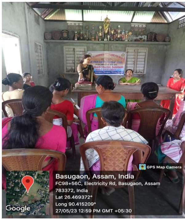
The program in progress.