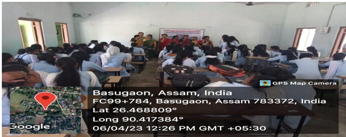
Cross section of the participants