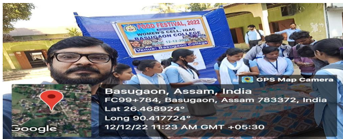
Cross section of the participant & visitors