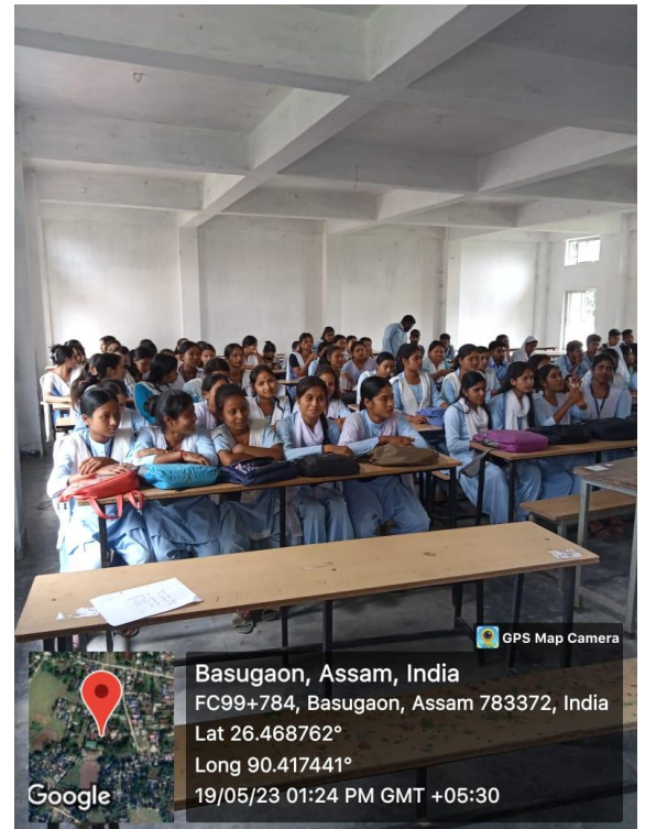
Cross section of the audience

He also stated that there is no short cut to success. With sincerity, dedications and focus on goals students can achieve miracles.