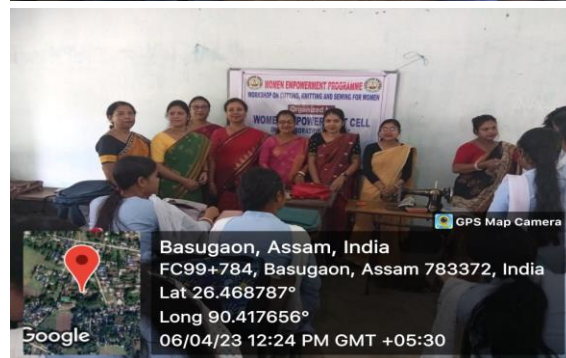
Cross section of the participants