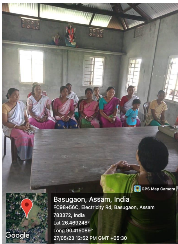
Cross section of the audience

Mrs. Choudhury also stressed on cleaning of hands with soap before cooking and eating by all family members including children and also need for habits of regular bath by family members.