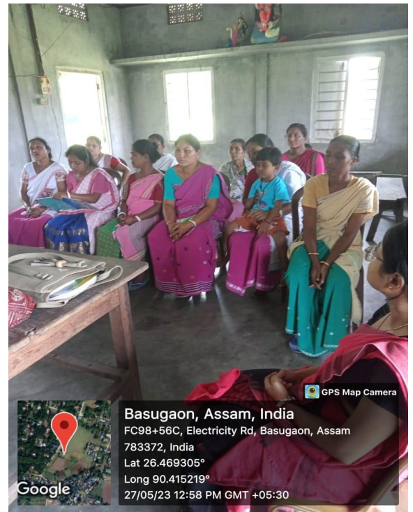
Cross section of the audience