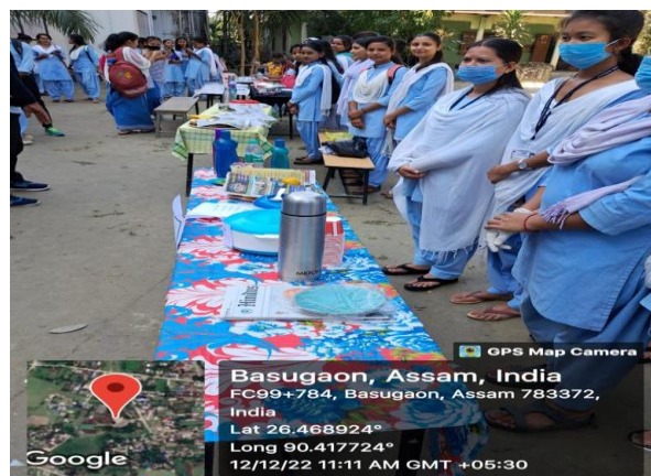
Participants of the Food Festival